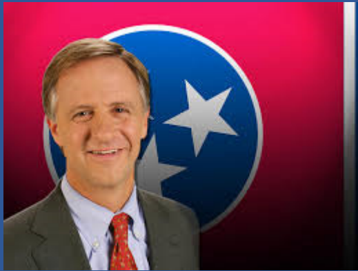
Governor Bill Haslam